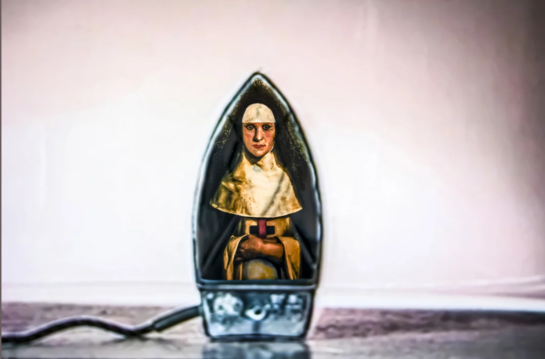
"Irony" - 2019"