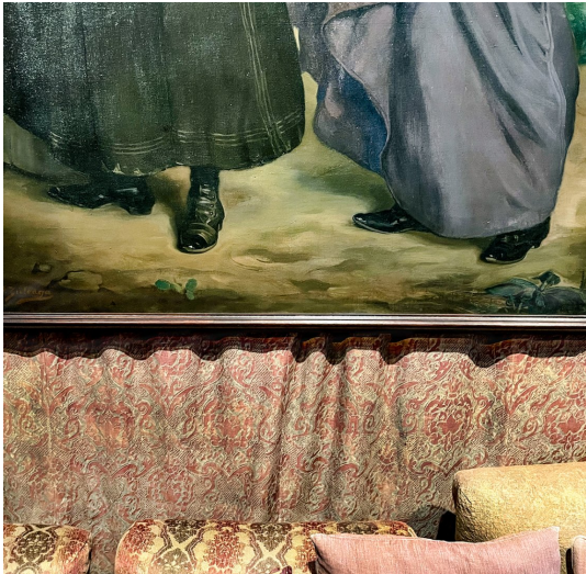
"Ladies Over Sofa" – 2022