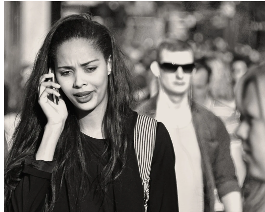
"Is That So?" 2023